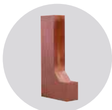
Forged L Block