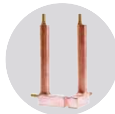
Forged L Holders