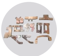
Forged Profile Plates