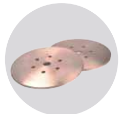
Forged Seam Weld Wheel