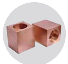
Forged Seam Weld Housing